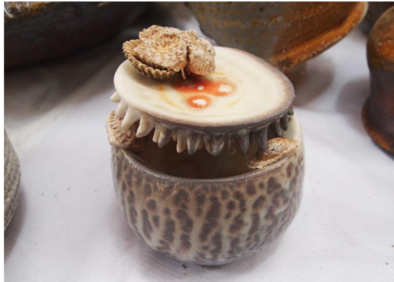
Picture 5 : Pattern from cockle and firing in a high temperature kiln with firewood a traditional porcelain making.

7. The creativity results shown and the exhibition taken place.